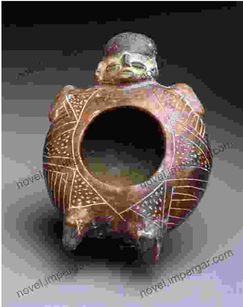
Golden Adornments: Uncovering the Treasures of Challuabamba

The ceramics of Challuabamba are not only aesthetically pleasing but also provide valuable insights into the daily lives and beliefs of the people who created them. Many vessels depict scenes from everyday life, such as farming, hunting, and feasting. Others bear religious motifs, suggesting that ceramics played a significant role in the spiritual practices of the ancient inhabitants.