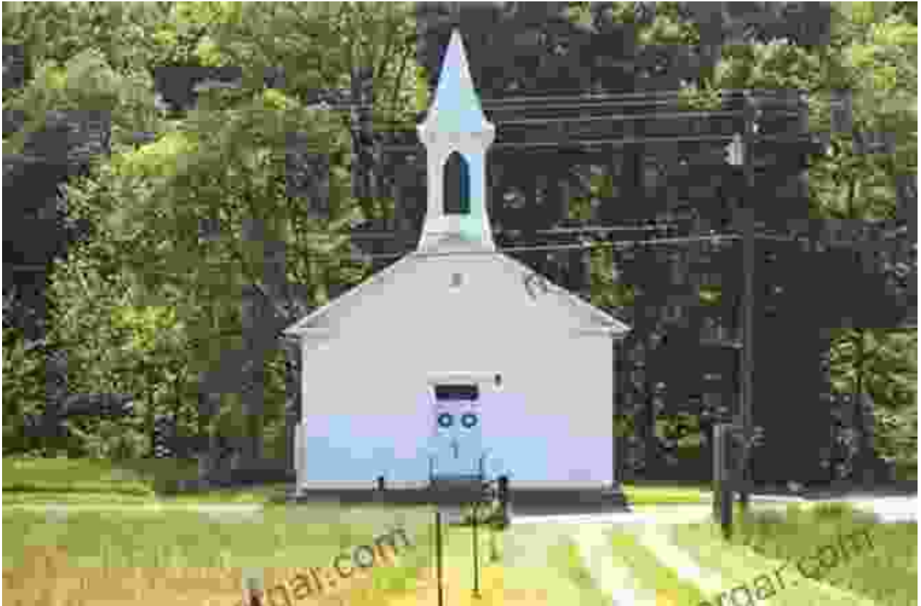
Bishop Church: A Sanctuary of Faith