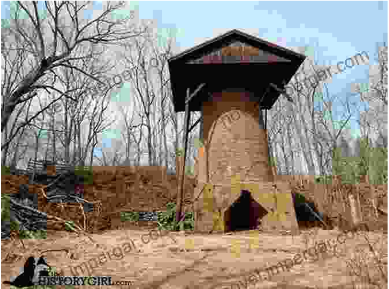
Britton Iron Furnace: A Beacon of Industrial Ingenuity